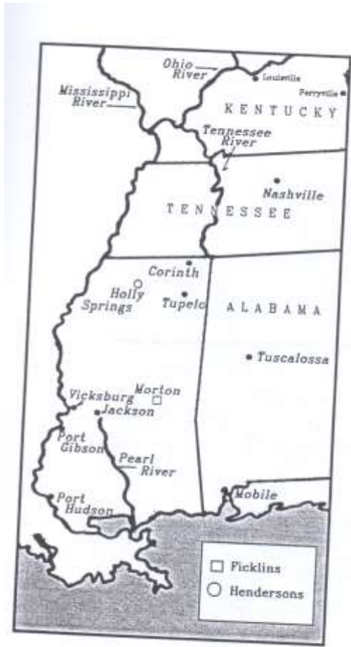
WAR IN MISSISSIPPI, 1863